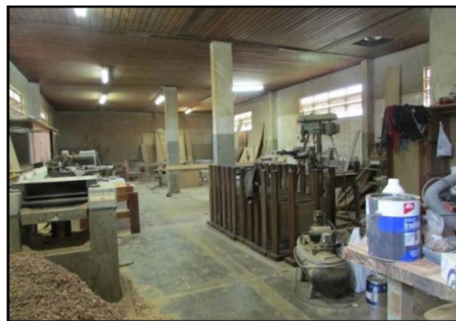
Figure 2. Internal view of the Manaus company.