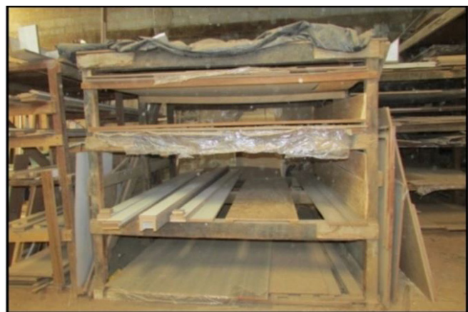
Figure 6. Internal view of the company in Belo Horizonte.

in the workshop. With regard to the attitude barrier, the company manager was very accessible to the study and the possibilities of change.