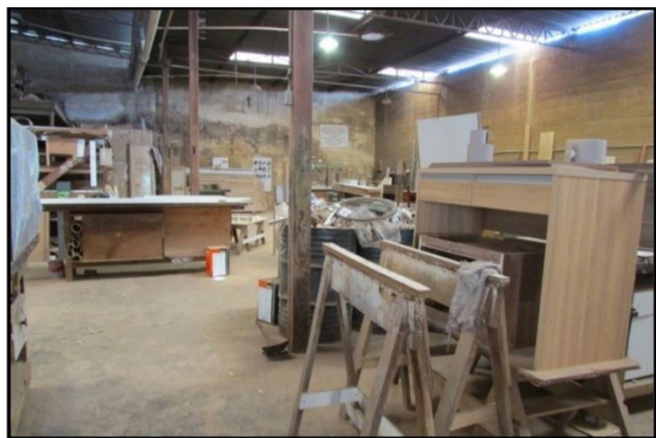
Figure 5. Internal view of the company in Belo Horizonte.

As for the organizational barriers, the employees help to account for the MDF that they used in furniture production. They are satisfied with the way the project is presented and the communication with management to answer questions. But they say that the division of labor and the way furniture is produced can be improved by replacing the equipment