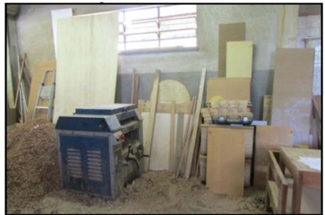
Figure 3. Material leftover from the company in Manaus.

The company also has a storage area for the leftovers (Figure 6), which facilitates the visualization and cataloging