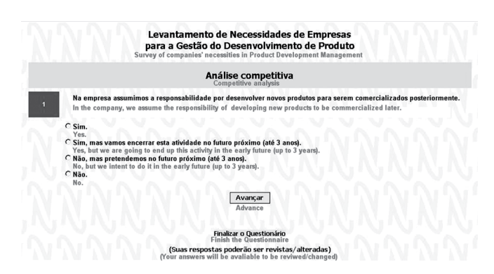
Figure 1. Snapshot of one of the screens in the system.

After the preliminary sample was sectored, some representation of all sectors was needed, which led to a total of 97 companies. In the end, a final sample of 100 companies was determined to be used in the field work. Once the sample was calculated, all companies to be interviewed were registered on the web-based questionnaire system. That meant registering name, address, contact name,