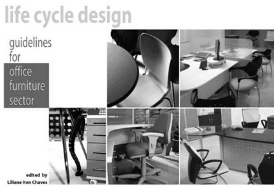
Figure 3. Life cycle design guidelines for office furniture sector.

tor and the kind of application regarding design for sustainability (assessment, prioritizing or orienting action plans);