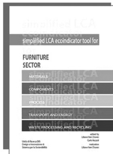
Figure 2. Simplified LCA ecoindicator tool for furniture sector strategy.

Some formulas were used to achieve a value. Each criteria heading is computed, according to a potential environmental improvement, and compared to each other. The highest potential will receive a value of 100; the other